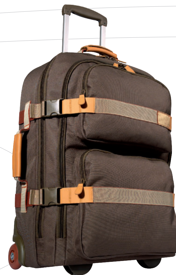
Eonic in charge of manufacturing process

Confidentiality agreements are signed. Detailed product specification sheets are sent to selected suppliers. Quotes, production lead time are finalised and sent for final approval to our customers.